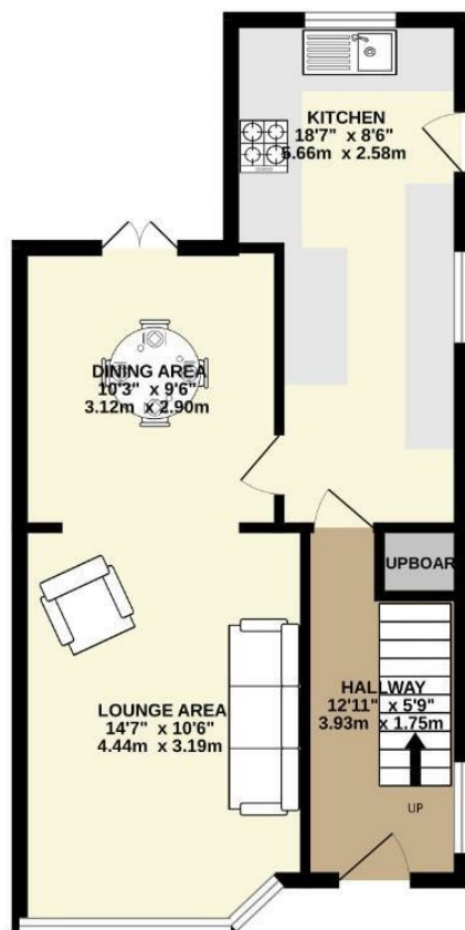
GROUND FLOOR 460 sq.ft. (42.7 sq.m.) approx.